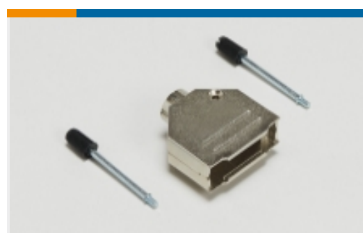
D-Sub Backshells & Clamps(135)