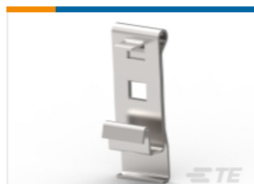
TE Part # 745255-2 SPRING LATCH 2/BAG