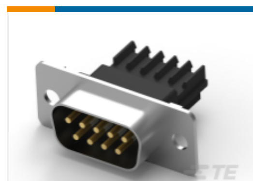
TE Part # CAT-AM7-248H3 IDC D-Sub: Plug Assembly, Wire to Wire, Signal, 2.77 mm