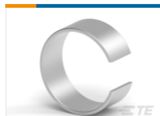
TE Part # 745508-1 FERRULE SPLIT RING, HD